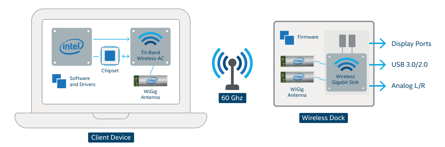
Figure 1. Intel Wireless Docking: Every component, from drivers and firmware to the silicon Tri-Band Wireless-AC module, antennas and dock "sink" chip, are developed and tested together to provide the best solution for the end-user.

With this configuration a single cable now provides more data and video bandwidth than any other cable, while also supplying power. (Figure 2).